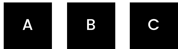
How God sees Sin (Top View)